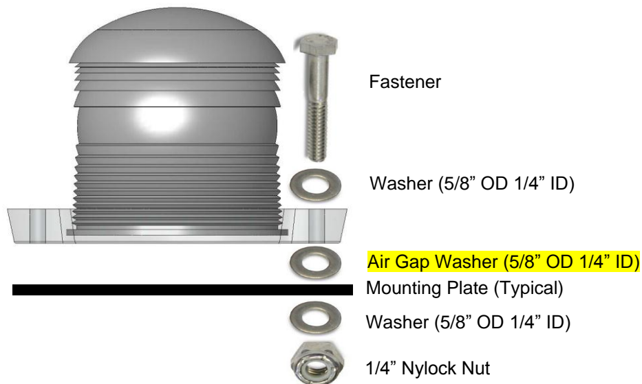
Figure 1. Mounting Hardware Arrangement

The vent position is shown in Figure 2. Carmanah’s 502 standard fastener set (part # 38334) contains sufficient fasteners, washers and nuts for the mounting arrangement shown in Figure 1.