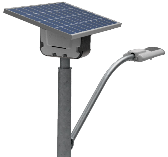
Carmanah EG80 Off-Grid Solar LED Lighting System

The EG40-80 series features a high performance LED fixture. With superior uniformity and light performance, Carmanah solar lighting systems illuminate a given area with fewer systems than other solar solutions, providing significant savings in overall project cost.