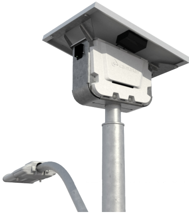
Carmanah EG40 Off-Grid Solar LED Lighting System