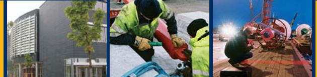
Headquarter in Schwerin, Germany

Sabik Informationssysteme is located close to Hamburg, Germany between the Baltic and North Seas, with some 7,000 km. of German inland waterways to the south. We are partners to various public and private operators of visual navigation aids and we provide solutions, technical support, installation and maintenance services. New advanced technologies, including electronics and software are being used increasingly to help rationalise the operation of navigation aids. To this end, we provide systems and solutions based on modern and advanced components, but designed to be simple, efficient and above all reliable in daily operation.