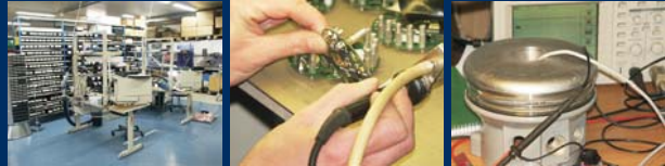
LED signal production in Porvo, Finland

Sabik Oy is a Finnish based company specialising in the development and manufacture of visual aids for navigation. The waters around Finland count among the most challenging in the world to navigate and are characterised by dense fog, high winds, seasonal ice, freezing rain, blizzards and months without daylight. Sabik accordingly maintains a tradition of high standards, development and quality production and is a leader in the adaptation of new technologies. Our objective is to improve the reliability of visual navigation aids and thereby reduce the need for periodical maintenance.